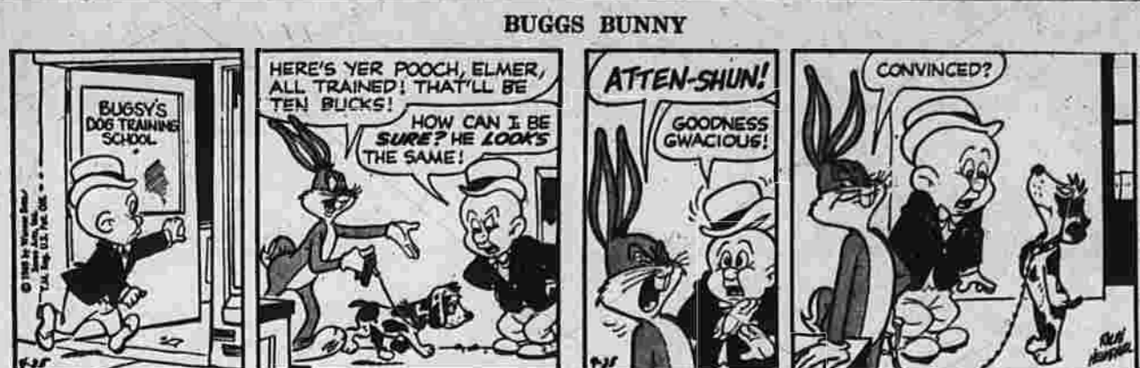
BUGGS BUNNY BY V. T. HAMLIN