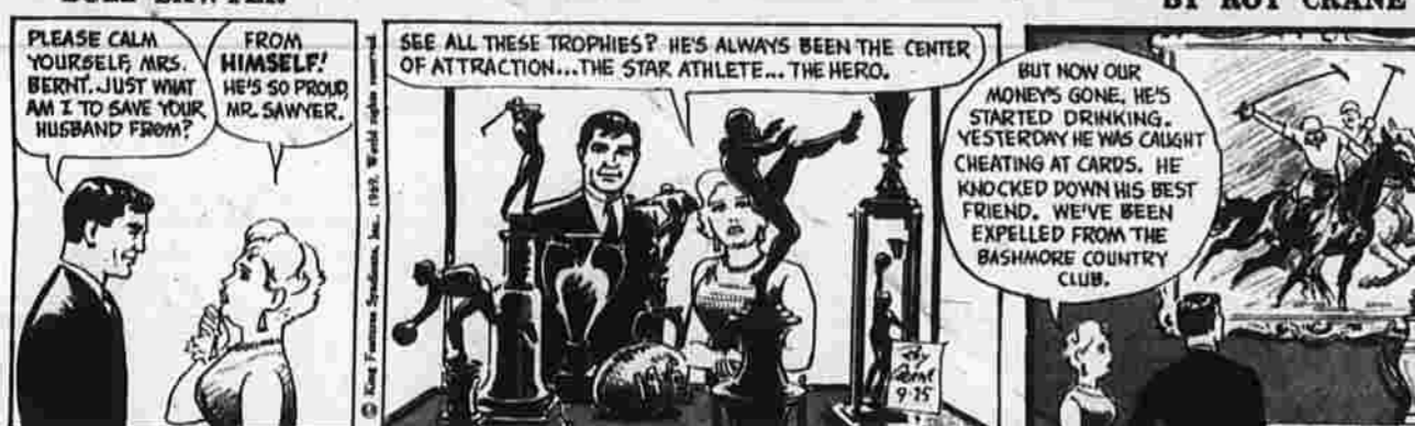
BUZZ SAWYER BY ROY CRANE