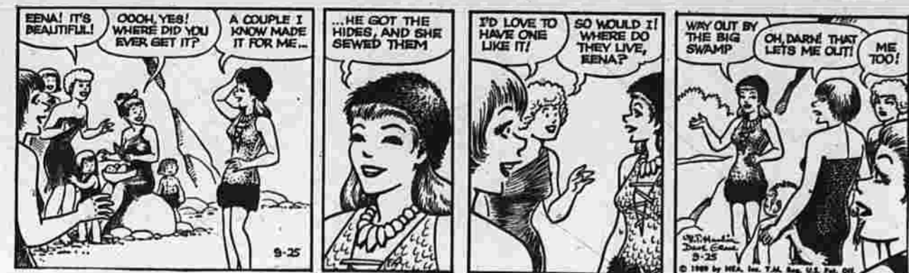
ALLEY OOP BY V. T. HAMLIN