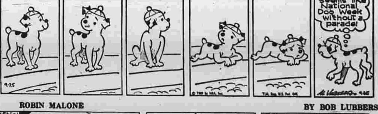
PRISCILLA'S POP BY AL VERMEER