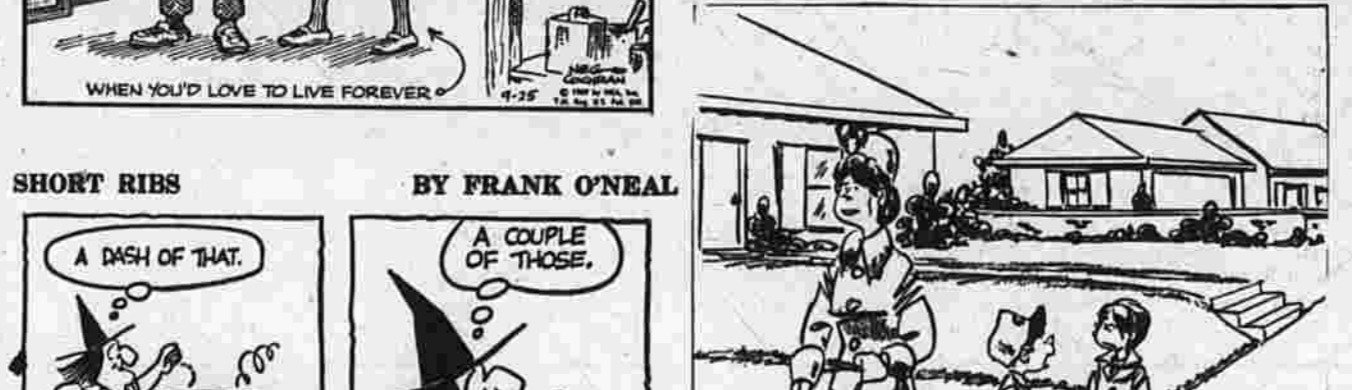
SHORT RIBS BY FRANK O'NEAL