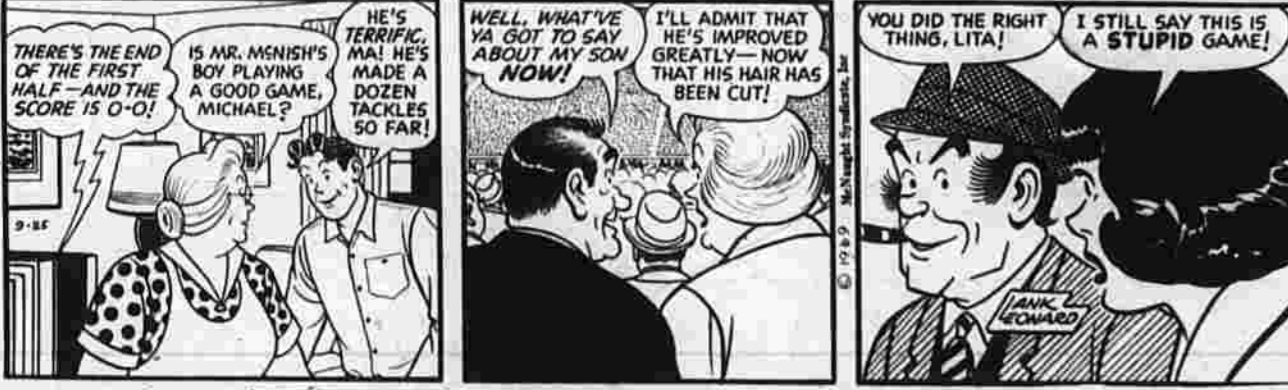
MICKEY FINN BY LANK LEONARD