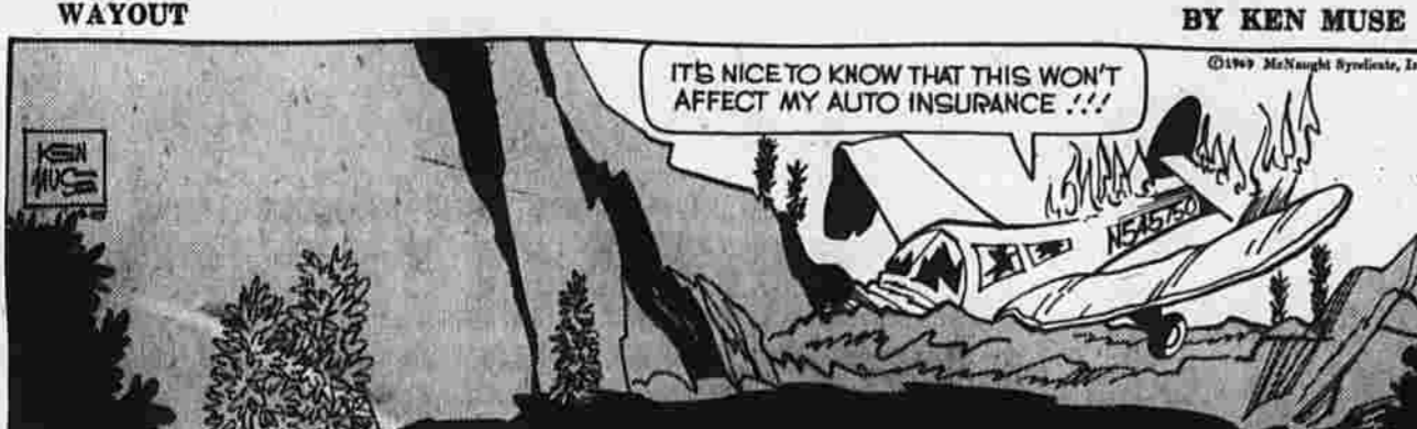
WAYOUT BY KEN MUSE